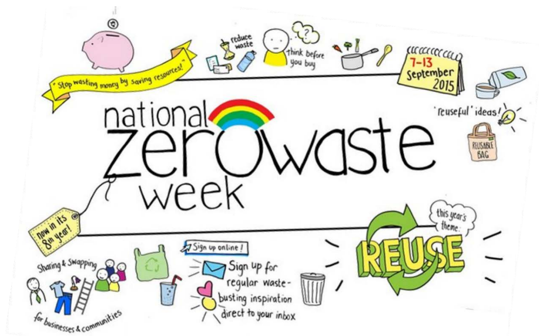
Figure 4. Example of graffiti after class environmental education

The production of English signboards enables students to apply Basic English and receive environmental education in English learning, so that they can understand civilization, cultivate good environmental behavior habits, and realize that the environment must be started from everyday matters [6].