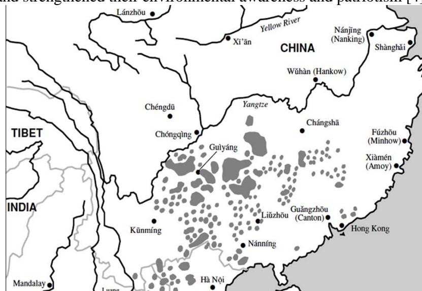
Figure 2. General Map of China's environmental history

At the same time, it is also possible to extend the content of classroom education and introduce the Chinese environmental history closely related to our country's life. It is The Retreat of the Elephants: An Environmental History of China by Maoke Yi. This book is hailed as the foundation stone for Western scholars to write about China's environmental history. It is divided into three parts: patterns, special cases, and concepts, including geographical indications and time stamps, three thousand years of struggle between humans and elephants, an overview of deforestation, and forest abuse. The relationship between felled areas and tree species, war and short-term benefits, the cost of maintaining water and water systems, the story of Jiaying from the object to Minfeng, the colonization of Han Chinese in the Miao nationality in Guizhou, the mystery of Zunhua's longevity, and nature 12 chapters on revelation, science and living things, empire creeds and personal opinions. The book mainly writes about the impact of the elephant's south withdrawal, forest destruction, and war water system on the environment, and outlines the "one general map" of China's environmental history (Fig. 2), especially the authentic English and rich expressions. The students received good teaching results and strengthened their environmental awareness and patriotism [4].